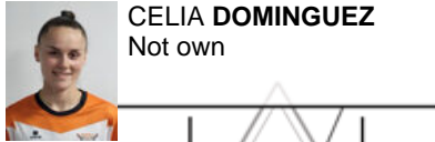
CELIA DOMINGUEZ Not own