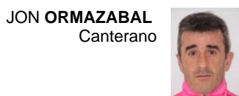
JON ORMAZABAL Canterano