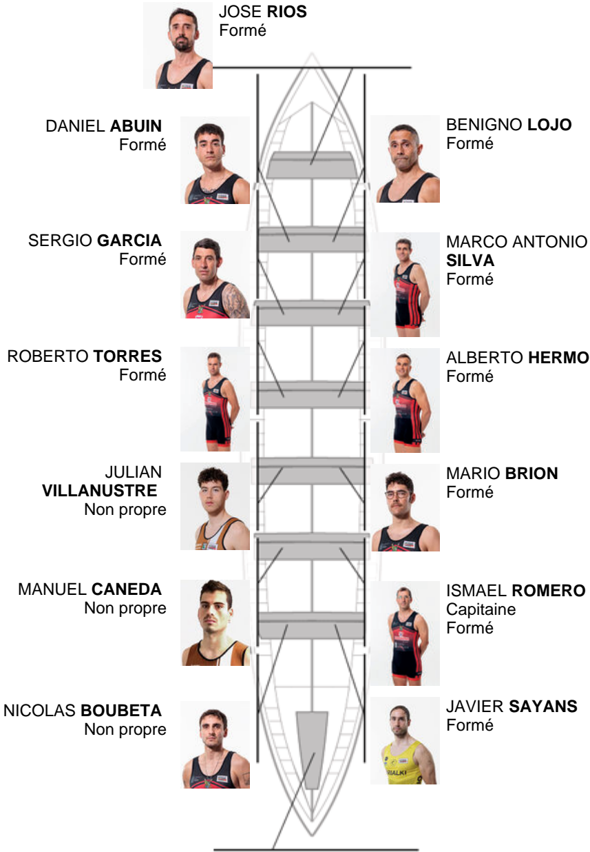
FELIX DUARTE type unknown Non propre