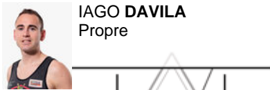
IAGO DAVILA Propre