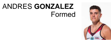
ANDRES GONZALEZ Formed