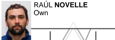
RAÚL NOVELLE Own